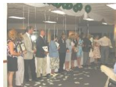
The graduation line-up!